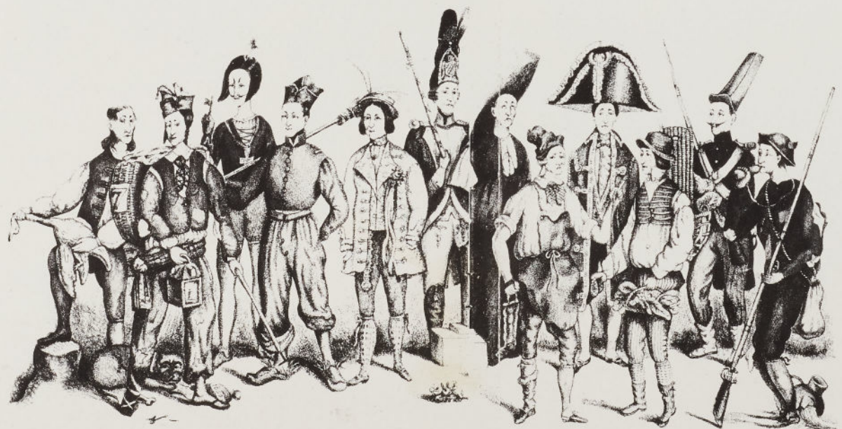
Love and Disorder The Thousand French Bill Black and White The Handsome Soldiers The Deques The Trulls The Devils Fair The Sprite The Dream of Gold The Salad Men Perrot in Africa Piffette or the Two Pawkers