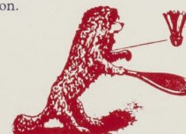
Latest novelty CLOCKWORK DOG. jumps along tilting balladore and shuttlescock. Price, 10 6.

Her performing chisel proudly presents an unbelievable conflagration of theatrical properties, puppets and amazing animation. Her fingers have flown and her mind has raced in a maelstrom of creative ingenuity, featuring a dazzling array of mind-boggling illusion.